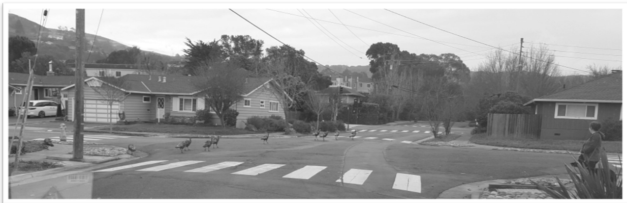
A gaggle of Wild Turkey's spotted in December at the corner of Seawolf and Spindrift

Paper and cardboard that is contaminated with spilled liquids and broken glass in the single stream container or truck ends up in the landfill rather than being recycled. Prices for clean glass/plastic/aluminum recyclables is