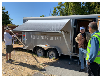
Checking out the new awning & lighting equipment at the Cove Emergency Trailer